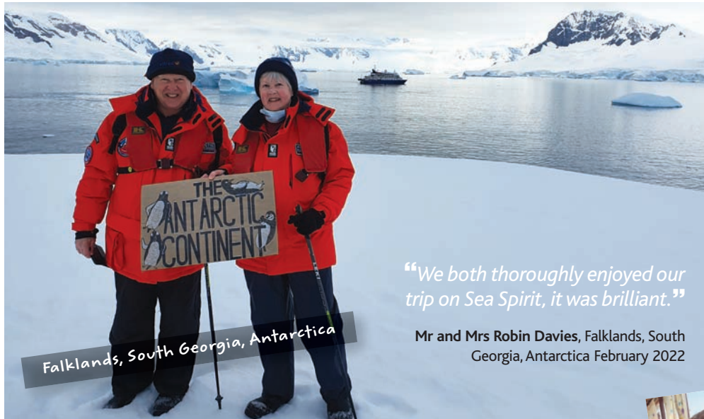
Falklands, South Georgia, Antarctica

"We both thoroughly enjoyed our trip on Sea Spirit, it was brilliant."