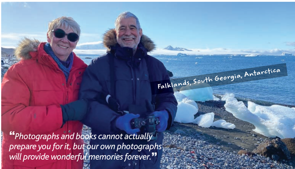
Falklands, South Georgia, Antarctica

"Photographs and books cannot actually prepare you for it, but our own photographs will provide wonderful memories forever."