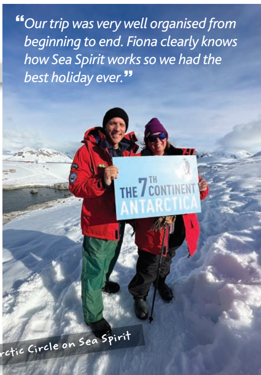
Antarctic Circle on Sea Spirit