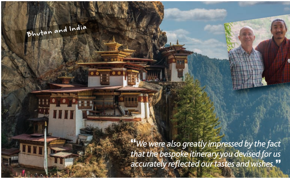
Bhutan and India

"We were also greatly impressed by the fact that the bespoke itinerary you devised for us accurately reflected our tastes and wishes."