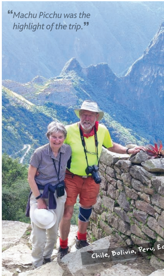
Chile, Bolivia, Peru, Ecuador

“Machu Picchu was the highlight of the trip.”