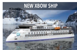
NEW XBOW SHIP