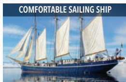
COMFORTABLE SAILING SHIP