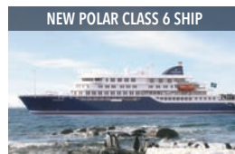
NEW POLAR CLASS 6 SHIP