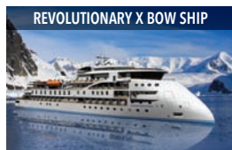
REVOLUTIONARY X BOW SHIP