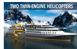
TWO TWIN-ENGINE HELICOPTERS