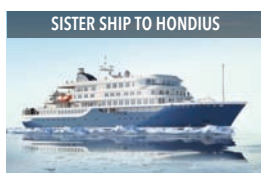
SISTER SHIP TO HONDIUS