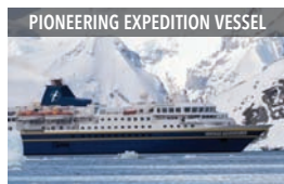
PIONEERING EXPEDITION VESSEL