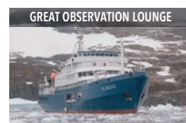
GREAT OBSERVATION LOUNGE