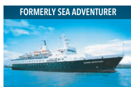
FORMERLY SEA ADVENTURER