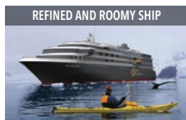
REFINED AND ROOMY SHIP

World Explorer – Launched in 2019, Ice Class 1B, all-balcony, all-suites expedition ship. Six tiers of deluxe accommodation, glass-domed observation lounge and numerous wellness and adventure options.