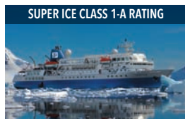
SUPER ICE CLASS 1-A RATING