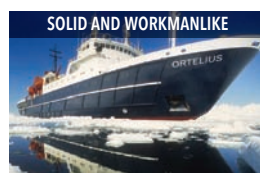
SOLID AND WORKMANLIKE