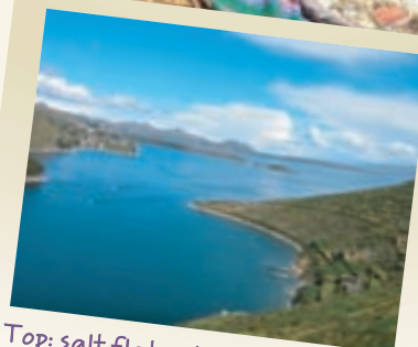
Top: salt flats at Sala de Uyuni; Centre: a picnic with the Iruitos people; Bottom: Lake Titicaca

Titicaca, to lunch on a floating reed-bed island with the ethnic Iruitos people. In glorious sunshine I sat cross-legged with the families in their colourful attire and picnicked on delicious locally made cheese, beans, sweet-corn, potatoes and fried fish. In the afternoon, floating away in a reed boat reminiscent of a Thor Heyerdahl Expedition, I continued my journey across the lake, alighting on a number of tiny islands each with its own character and surprises. There were